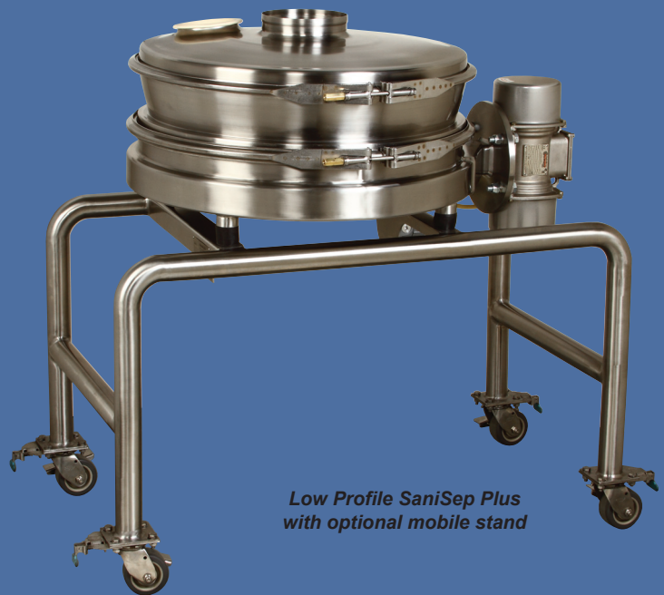
Low Profile SaniSep Plus with optional mobile stand

SaniSep Plus units are available in 24", 30", 40" and 48" sanitary base and low profile designs.